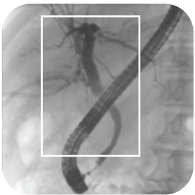
CBD Before Stent