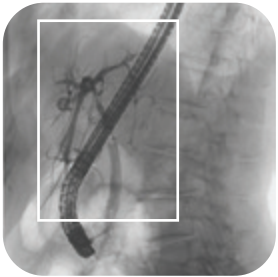
CBD Inj Balloon